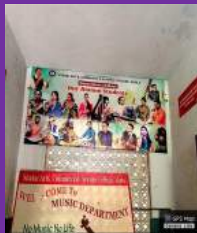
P294-FV, New Rasthakar Plot, Akola, Maharashtra 444001, India Latitude: 20.706436666666666° Longitude: 77.00643° Local 12:08:59 PM Altitude: 294 meters GMT 06:08:58 AM Tuesday, 30/05/2023