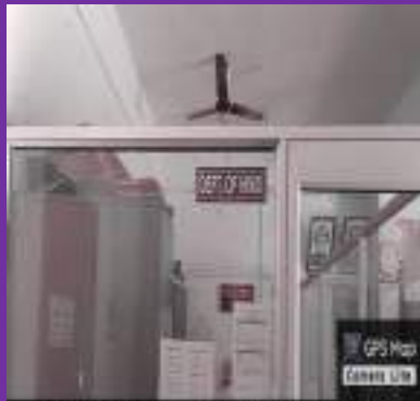
P294-FM0, New Rasthakar Plot, Akola, Maharashtra 444001, India Latitude: 20.7933907° Longitude: 77.8112049° Local 11:50:54 AM Altitude: 296 meters GMT 06:28:34 AM Tuesday, 30/05/2023