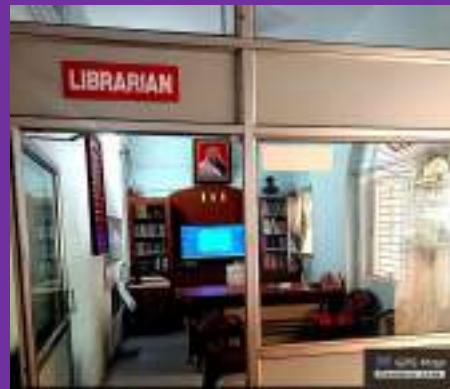
P294-CP1, New Rasthakar Plot, Akola, Maharashtra 444001, India Latitude: 20.705894999999998° Longitude: 77.00685° Local 11:56:32 AM Altitude: 296 meters GMT 06:26:30 AM Tuesday, 30/05/2023