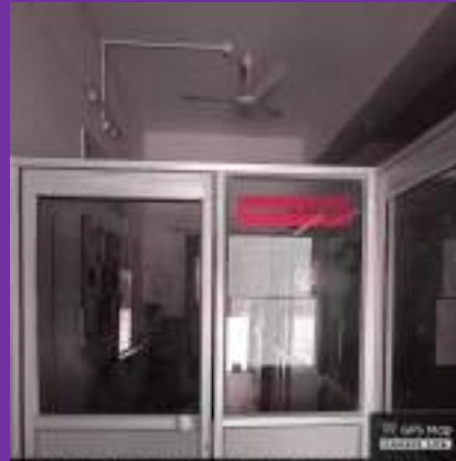
P294-CP1, New Rasthakar Plot, Akola, Maharashtra 444001, India Latitude: 20.706148333333333° Longitude: 77.006756666666666° Local 11:52:09 AM Altitude: 296 meters GMT 06:27:06 AM Tuesday, 30/05/2023