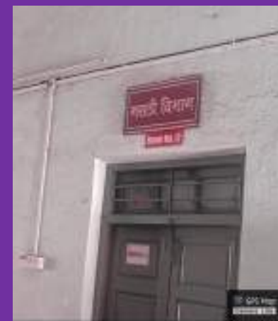
P294-CP1, New Rasthakar Plot, Akola, Maharashtra 444001, India Latitude: 20.7060054° Longitude: 77.0067013° Local 11:26:57 AM Altitude: 296 meters GMT 05:54:31 AM Tuesday, 30/05/2023