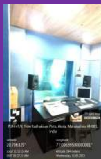
P244-FW, New Rajbhawan Pkts, Akola, Maharashtra 44001, India Latitude: 20.706325° Longitude: 77.00636500000001° Local: 11:52:35 AM Altitude: 294 meters GMT: 06:20:48 AM Wednesday, 11/08/2023