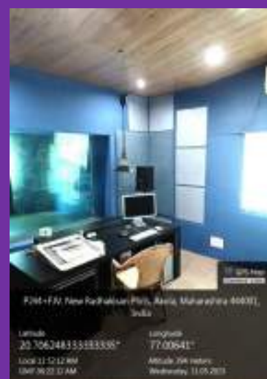
P244-FW, New Rajbhawan Pkts, Akola, Maharashtra 44001, India Latitude: 20.706248333333333° Longitude: 77.00641° Local: 11:52:12 AM Altitude: 294 meters GMT: 06:20:48 AM Wednesday, 11/08/2023