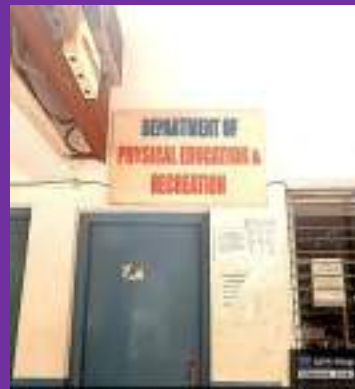
P294-FV, New Rasthakar Plot, Akola, Maharashtra 444001, India Latitude: 20.796346666666666° Longitude: 77.006438666666666° Local 12:07:47 PM Altitude: 294 meters GMT 06:11:41 AM Tuesday, 30/05/2023