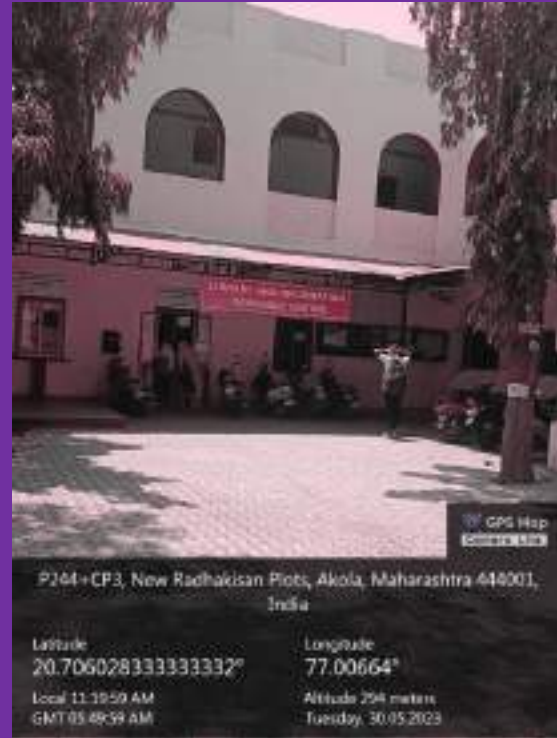
College Central Library