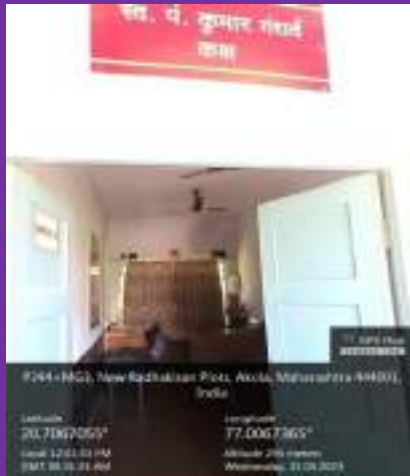
P244-HG2, New Rajbhawan Pkts, Akola, Maharashtra 44001, India Latitude: 20.71872657° Longitude: 77.0067365° Local: 12:51:33 PM Altitude: 294 meters GMT: 06:20:48 AM Wednesday, 11/08/2023