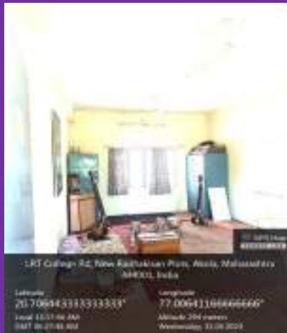
LRT College R2, New Rajbhawan Pkts, Akola, Maharashtra 44001, India Latitude: 20.70644333333333° Longitude: 77.00641166666666° Local: 12:51:36 AM Altitude: 294 meters GMT: 06:20:48 AM Wednesday, 11/08/2023