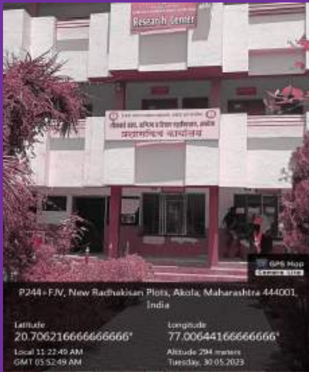
Administrative Building Exterior