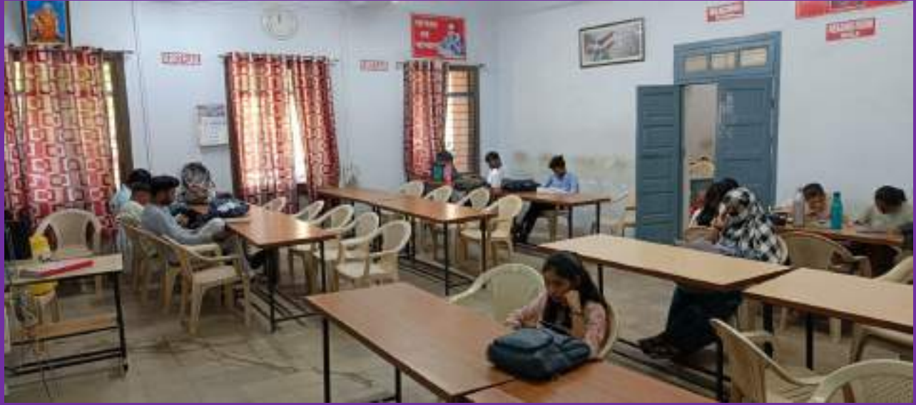
Library Reading Room