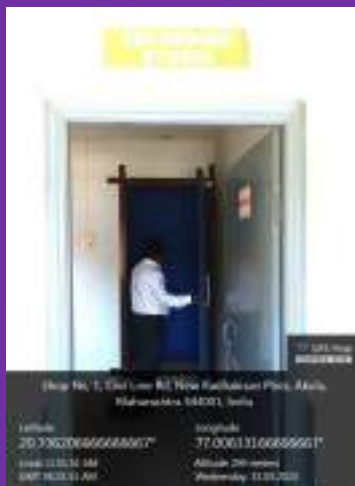
Block No. 1, 1st Floor R2, New Rajbhawan Pkts, Akola, Maharashtra 44001, India Latitude: 20.706206666666667° Longitude: 77.00613166666667° Local: 11:53:34 AM Altitude: 294 meters GMT: 06:20:48 AM Wednesday, 11/08/2023