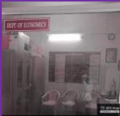
Shop No. 1, Civil Line Rd, New Rasthakar Plot, Akola, Maharashtra 444001, India Latitude: 20.7062854° Longitude: 77.0062454° Local 11:52:05 AM Altitude: 294 meters GMT 06:27:01 AM Tuesday, 30/05/2023