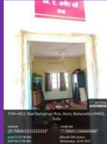
P244-M2L, New Rajbhawan Pkts, Akola, Maharashtra 44001, India Latitude: 20.70644333333333° Longitude: 77.00641166666666° Local: 11:51:38 AM Altitude: 294 meters GMT: 06:20:48 AM Wednesday, 11/08/2023