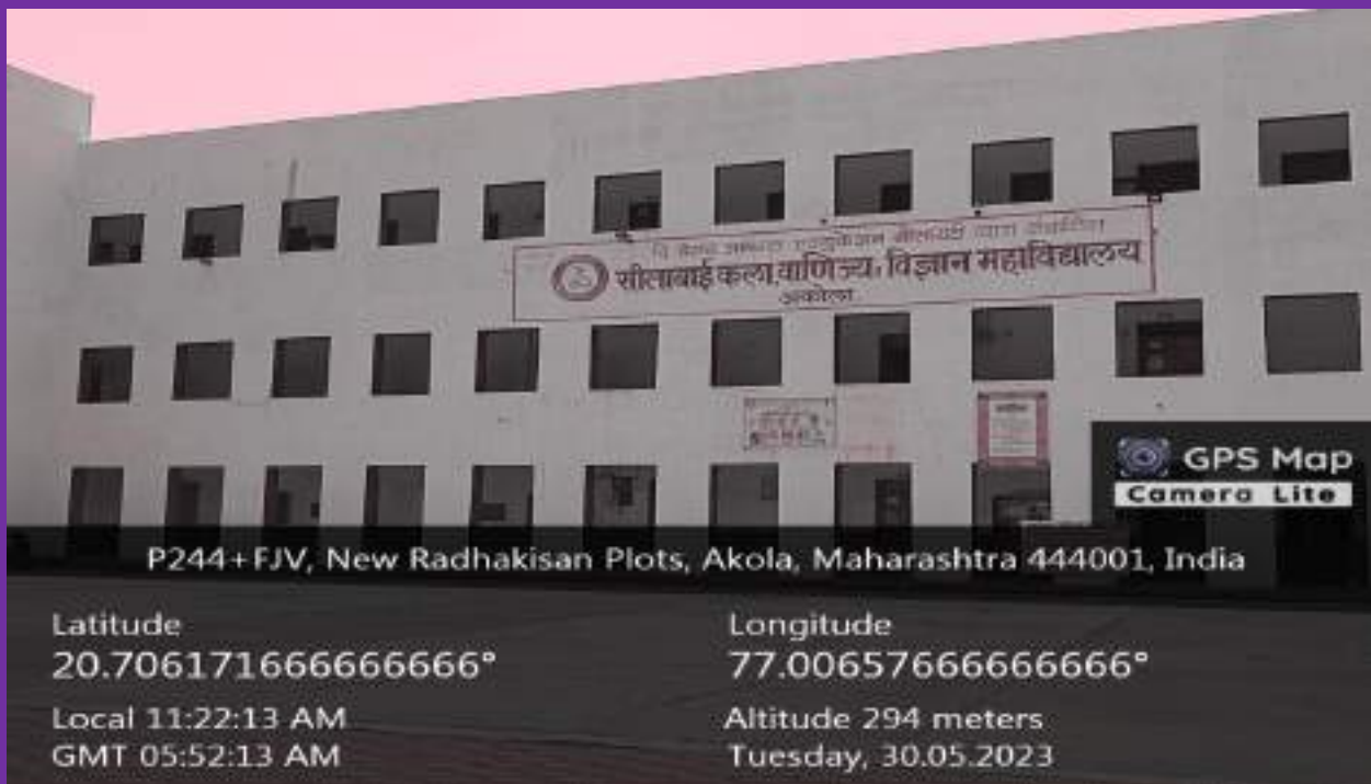
Classrooms View main Building