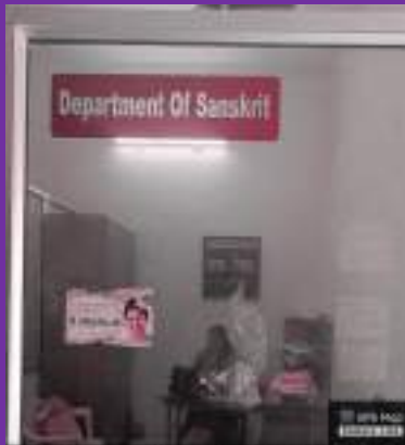
P294-FM0, New Rasthakar Plot, Akola, Maharashtra 444001, India Latitude: 20.7962019° Longitude: 77.006708515333334° Local 11:51:41 AM Altitude: 296 meters GMT 06:21:40 AM Tuesday, 30/05/2023