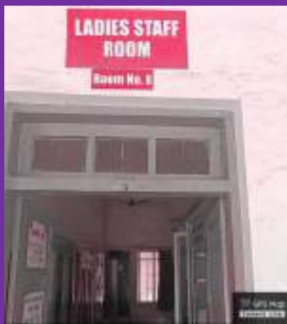
P294-FM0, New Rasthakar Plot, Akola, Maharashtra 444001, India Latitude: 20.71061° Longitude: 77.006676666666666° Local 11:51:29 AM Altitude: 296 meters GMT 06:21:26 AM Tuesday, 30/05/2023