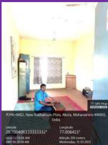
P244-MG1, New Rajbhawan Pkts, Akola, Maharashtra 44001, India Latitude: 20.706408333333333° Longitude: 77.006415° Local: 11:52:39 AM Altitude: 294 meters GMT: 06:20:48 AM Wednesday, 11/08/2023