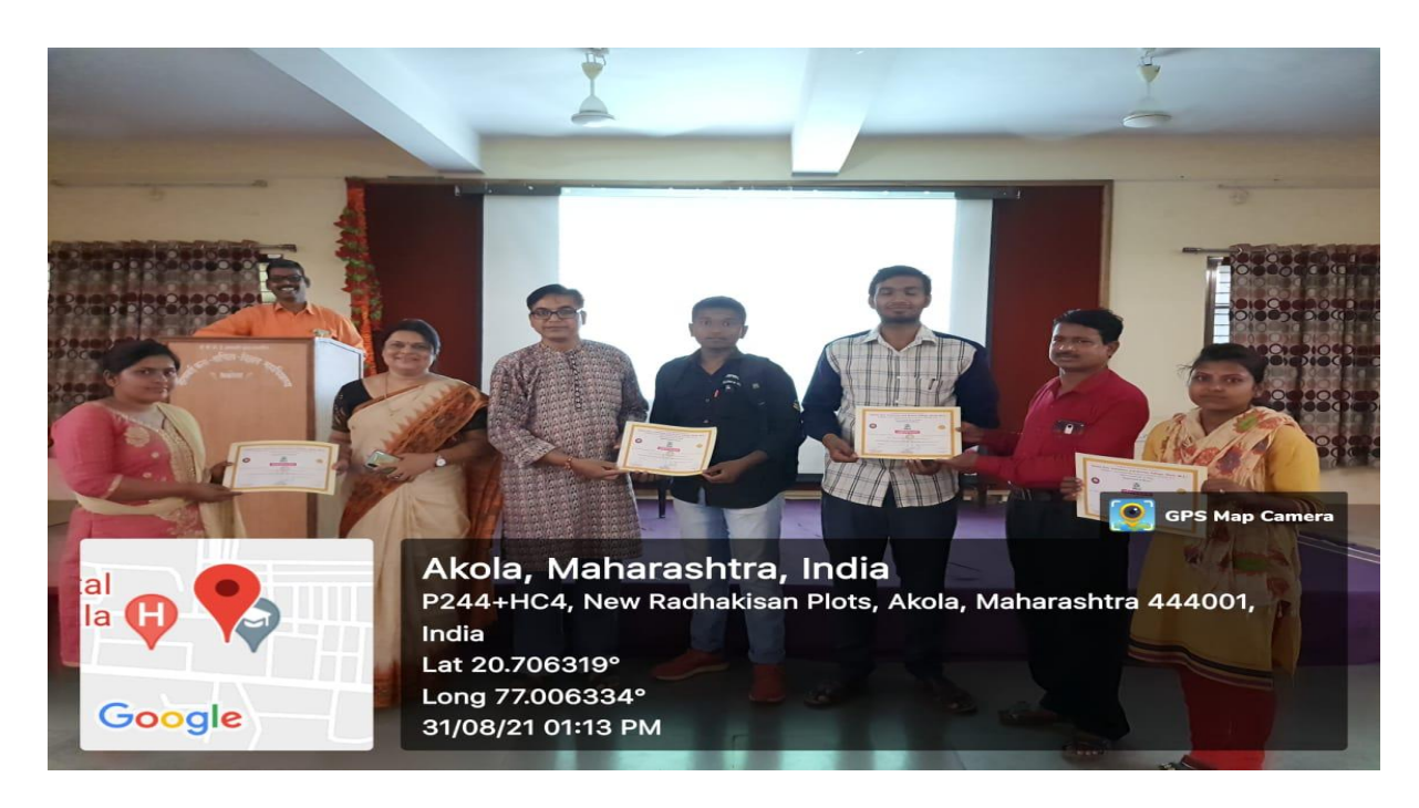
CERTIFICATE DISTRIBUTION PROGRAMME OF CERTIFICATE COURSE IN " FUNDAMENTALS OF ENGLISH GRAMMAR"